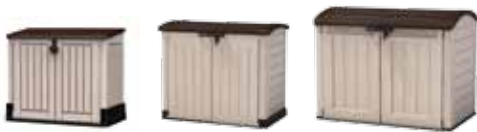
Woodland 30 Store-It-Out Arc Woodland Ultra